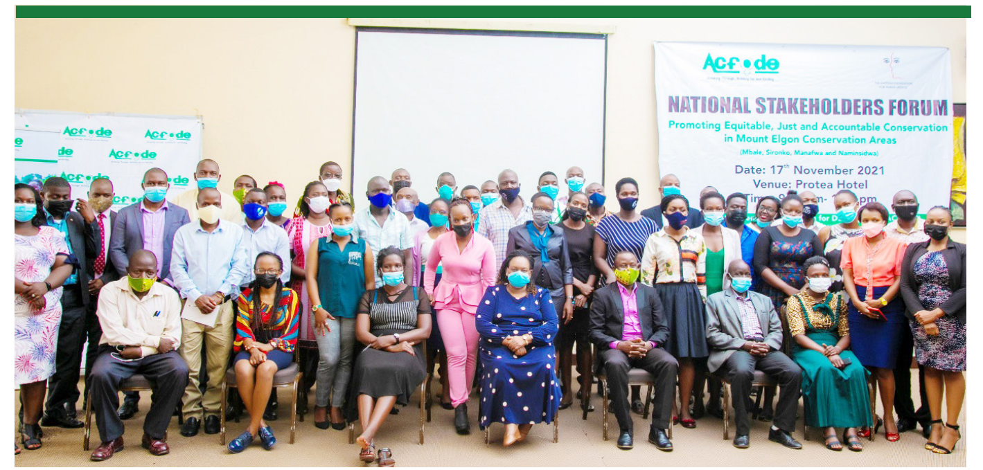
A cross section of stakeholders after the National forum on Conservation

The participants came up with strategies to ensure meaningful participation of frontline communities and entire body of citizens in the governance of the conservation areas.