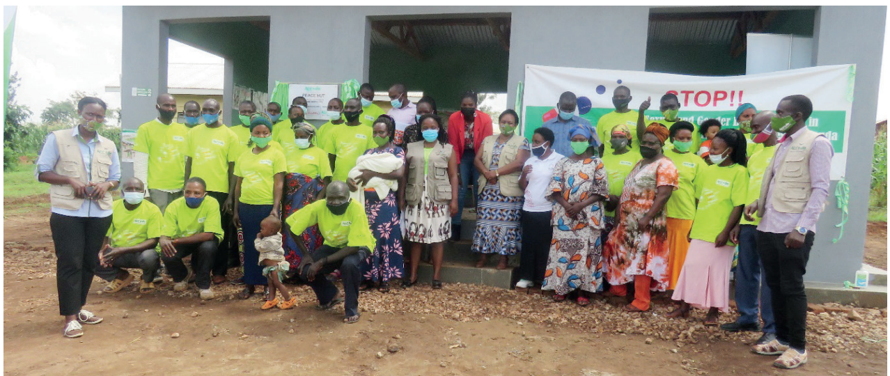
Community members embracing the launch of the Peace Hut