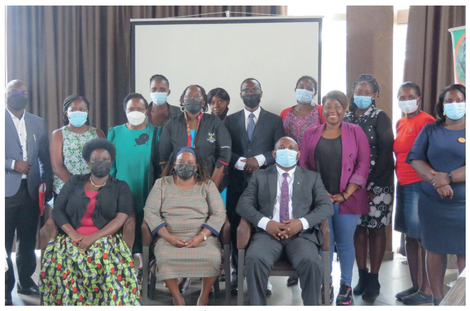
Stakeholders pose for photo after the meeting

The key recommendations included; The representation of MGLSD on the Eligibility Committee to provide technical support on gender, equal representation of women and men on the Eligibility Committee, a member from civil society and the host community to assist and advice based on local realities as well as a confidentiality clause that prohibits members of the REC from sharing or disclosing any information pertaining to a refugee or an asylum seeker to a third party except in the course of his or her duty is provided and with the consent of the Commissioner among others.