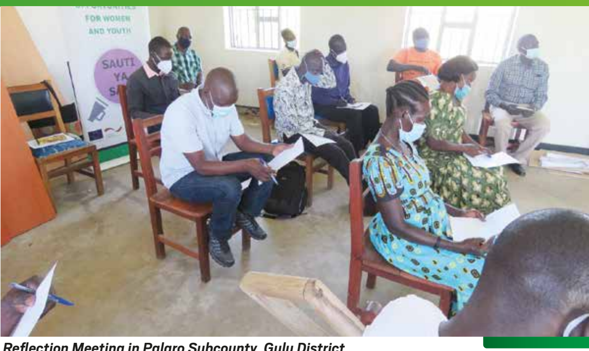
Reflection Meeting in Palaro Subcounty, Gulu District

The community dialogues inspired young women to come up and take leadership positions at the local council level. women have taken up leadership positions in community groups institutions like chairpersons of VSLA groups and