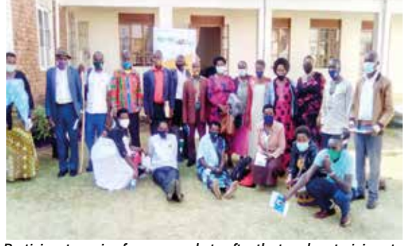
Participants posing for a group photo after the two days trainina at Muhabura view auest house in Kisoro municipality.

NUMBER OF PEOPLE WHO ATTENDED THE TRAINING INCLUSIVE OF 14 PEOPLE WITH DISABILITIES